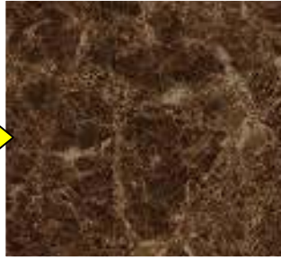
Soil before treatment with KF-D and after.